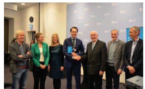
In December 2016, Dutch Minister of Agriculture Marijth van Dam accepted the NCad report "Transition to non-animal research".